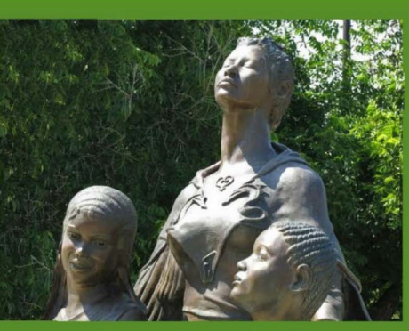
June 19th, 1865